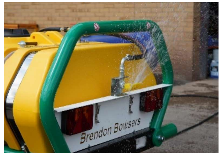
Whale tail for dust suppression