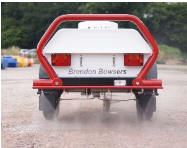
Spray bar for dust suppression