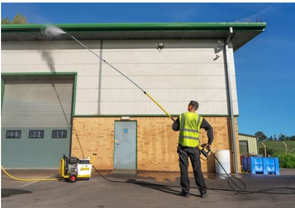
Telescopic lances 5 m and 7 m