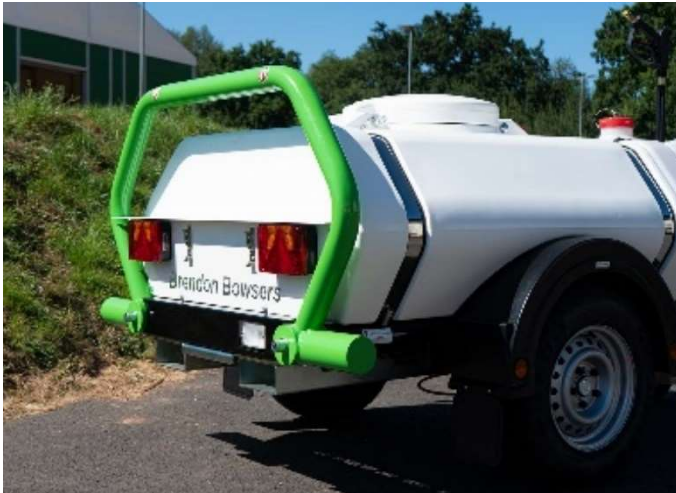
Lifting point for forklift