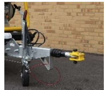
Anti-theft security: wheel clamp, hitch locks and bolts