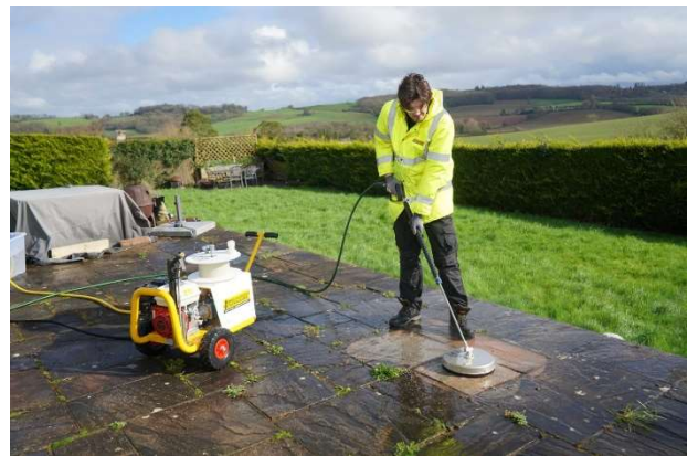
Small diameter surface cleaner