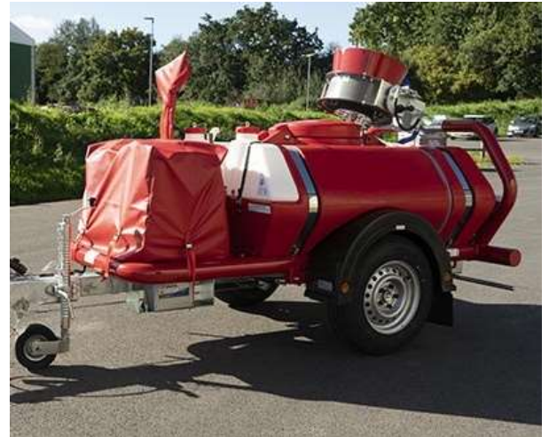
Weather protection engine and lance