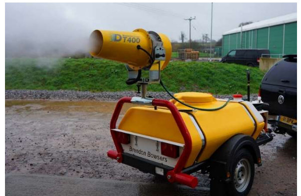
DT400 on trailer rear frame